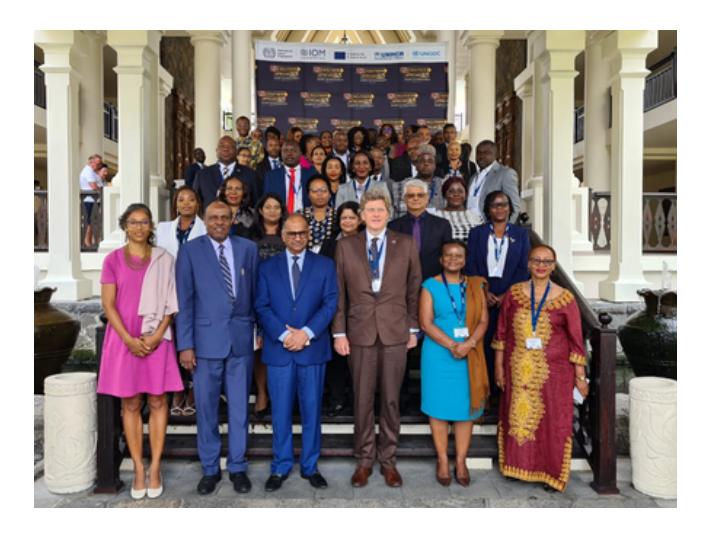
Event: Regional Diaspora Engagement and Investment Forum in Mauritius

The Southern African Development Community (SADC), a Regional Economic Community comprising 16 Member States, has increasingly recognised the developmental potential of a well-managed migration. This commitment has the political will and policy backing in the SADC Regional Migration Policy Framework and Action Plan (2022 to 2030), under which the strategic objectives aim to define SADC's diaspora and develop a regional diaspora policy and programme; map the socio-economic profile and interests of the diaspora in contributing to their Countries of origin; identify the needs of the diaspora, including different socio-economic groups within the diaspora, and how their government can be of service to them, to develop a relationship of mutual trust and benefit. In 2017, the Ministerial meeting at the Migration Dialogue in Southern Africa (MIDSA) recommended the development of programmes and innovative activities for the active engagement of Youth and the Diaspora to make a meaningful contribution to the social and economic development of their home countries as well as the SADC Community.