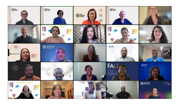
UN Pulse Accelerator

As iDiaspora continues to expand, our mission remains resolute: to empower passionate diaspora members in community development, catalyzing sustainable change and fostering meaningful partnerships for mobility pathways.