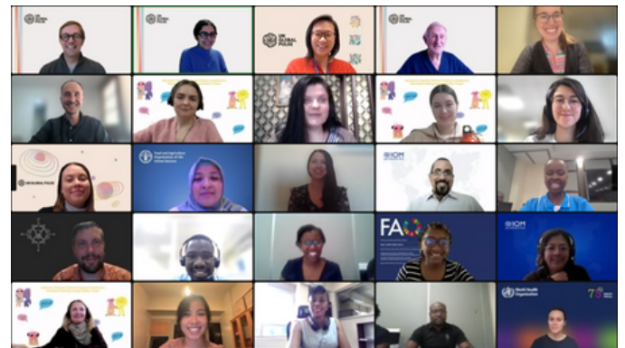
UN Pulse Accelerator

As iDiaspora continues to expand, our mission remains resolute: to empower passionate diaspora members in community development, catalyzing sustainable change and fostering meaningful partnerships for mobility pathways.