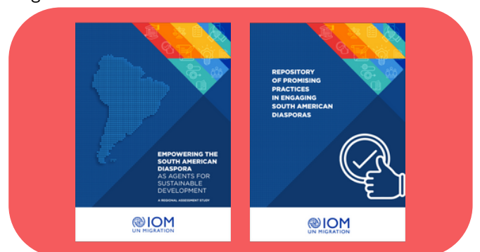
Explore these key resources on iDiaspora

The Roadmap's implementation began with a major step - a regional diaspora engagement training in November 2022. Representatives from Argentina, Chile, Colombia, Guyana, and beyond convened, facilitating shared learning and regional cooperation. As the journey advances from analysis to collaborative action, South American diaspora engagement thrives, transcending boundaries to unite nations. This journey acknowledges the diaspora's transformative potential, channeling not just remittances but skills, networks, and cultural bonds for positive change.