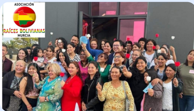
Mother's Days

The Bolivian Roots Association (Asociación Raíces Bolivianas) emphasizes the significance of social support and the creation of spaces that encourage communal bonding, opinion exchange, anecdote sharing, and the fostering of mutual aid. This approach is crucial as it aids in minimizing the vulnerabilities that individuals may face. Furthermore, it leads to enhancements in the working conditions and overall well-being of both migrant individuals and the host community. Every initiative taken in this direction plays a pivotal role in achieving these goals.