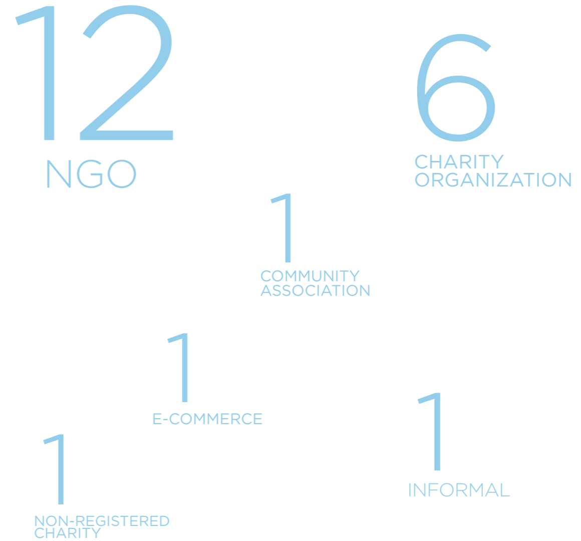
Figure 1: Type of Diaspora Organization Nature of Organization & Number of Afghan DOs

There is not a standard type or legal format for DOs, including for Afghan DOs. Whereas previous DEMAC research has already indicated that DOs usually originate from informal networks, DOs will normally go through a development of becoming more formalized in an effort to increase their professionalization and access. Yet, differences continue to exist, as is shown in the table on the following page referring to the 22 DOs involved in this RTR. Whereas it remains unclear how many DOs are properly registered in Afghanistan to conduct humanitarian operations, various data from the research indicates that most DOs are not. This assumption originates from anecdotal evidence as shared by individual DOs, but also based on the fact that local registration is a requirement to become a cluster member and this is the main impediment for DOs when applying for membership.