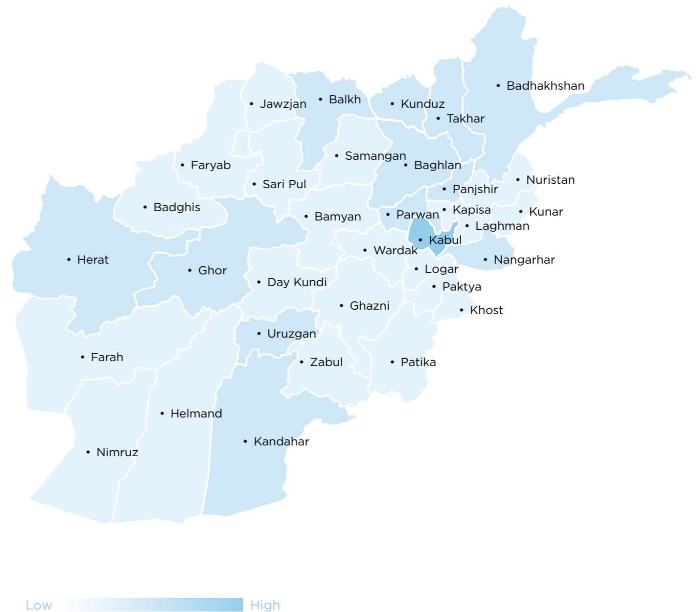
Figure 3: Indicative areas within Afghanistan receiving assistance from diaspora organizations engaged through this Real-Time Review

DOs have an extended reach in Afghanistan to all provinces which includes minority groups, ethnic groups, internally displaced people and other vulnerable groups and physically remote rural communities. The reach of DOs is supported by their representatives in country with enduring links to Afghanistan that support DO responses. In addition, DOs benefit from personal networks with Afghan communities in neighboring countries to expand their activities in countries including Pakistan and Iran.