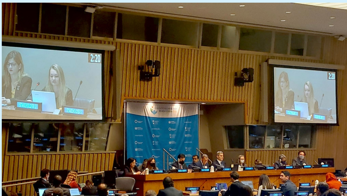
Intervening at the first International Migration Review Forum.